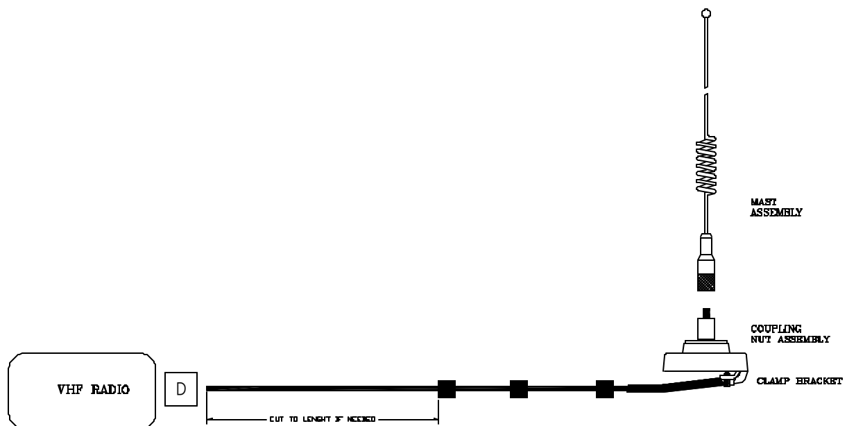
VHF Superband ® Cellular Look-Alike Antenna

Tighten setscrews to contact grounding surface.